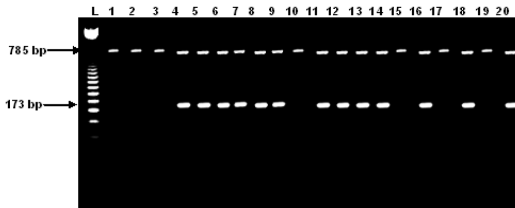
Figure 1. Genetic polymorphism APOE4 in patients. Key: Ladder- 50 bp ladder marker; Lanes: 1, 2, 3, 10, 15, 17, 19 (No Polymorphism); Lanes: 4, 5, 6, 7, 8, 9, 11, 12, 13, 14, 16, 18, 20 ( APOE4 Polymorphism).